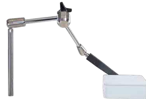
The UroNav electromagnetic field generator is positioned above the patient's pelvis.